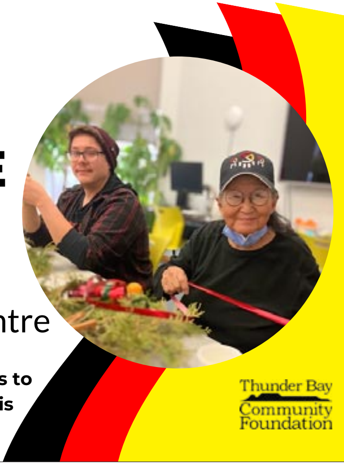
Thunder Bay Community Foundation

Join us and our community partners to learn more about changing what it is to be blind today.