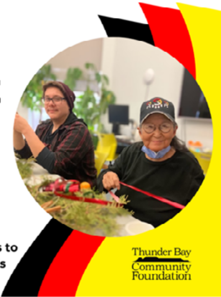
Thunder Bay Community Foundation

Join us and our community partners to learn more about changing what it is to be blind today.