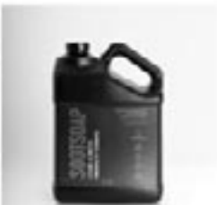
Scootsoap™ Bulk Hand & Body Wash $200