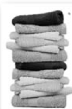
Wash Cloth $5

High-quality washcloths that are designed for heavy use. Note: This is a donation to NFRA to buy this equipment for our emergency services; no product will be shipped to you after your donation, but you will receive a charity tax receipt for orders with a total of $20 or more.