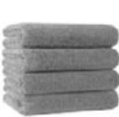
Bath Towel $10

You can be part of this new build by supplying the needed items!