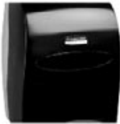
Paper Towel Dispenser $150