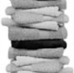
Wash Cloth $5.00

Questions/Comments? Email us at nfraevents@gmail.com