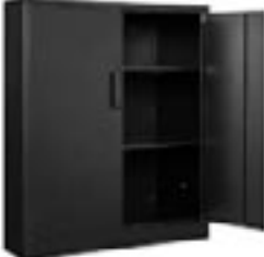
Storage Cabinet $400